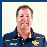
Australian Swim Team Coach #117 New Zealand Olympic Swim Team Coach 2016

For more information scan here to get in touch