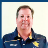
Australian Swim Team Coach #117 New Zealand Olympic Swim Team Coach 2016

For more information scan here to get in touch